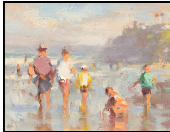
PAINTING BY RYAN JENSEN