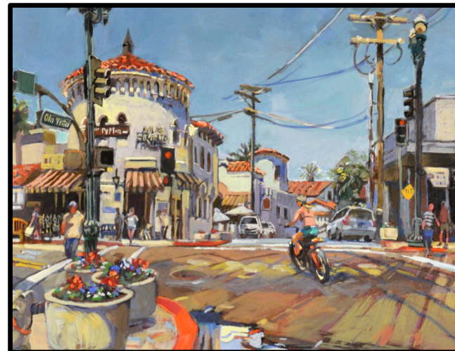
PAINTING BY KRENTZ JOHNSON

A JUDGED FINE ART COMPETITION CONTINUING THE CALIFORNIA PLEIN AIR TRADITION