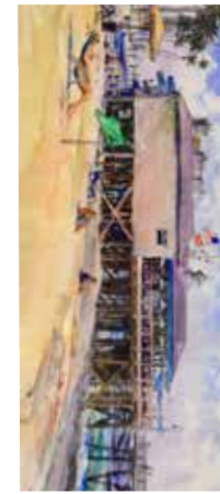
A JUDGED FINE ART COMPETITION CONTINUING THE CALIFORNIA PLEIN AIR TRADITION