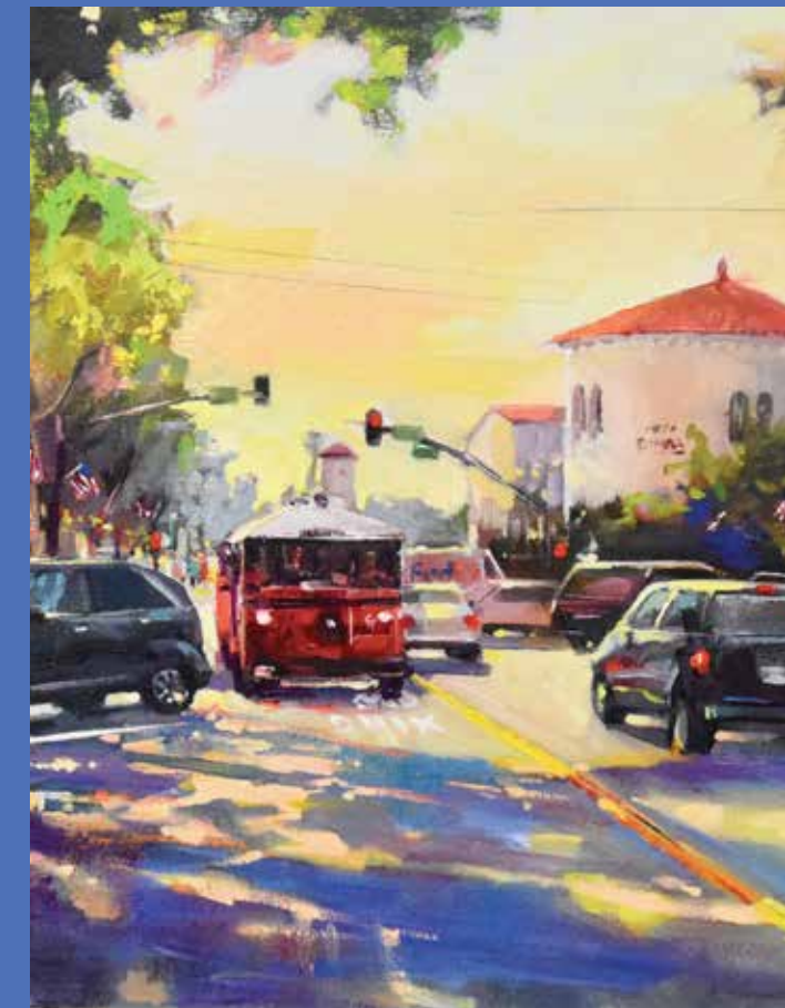
PAINTING BY HERMANN CHEN