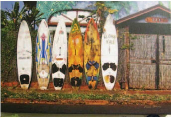
First Place, Photography: Winter Judged Show: Frank Stockl "Board Review"