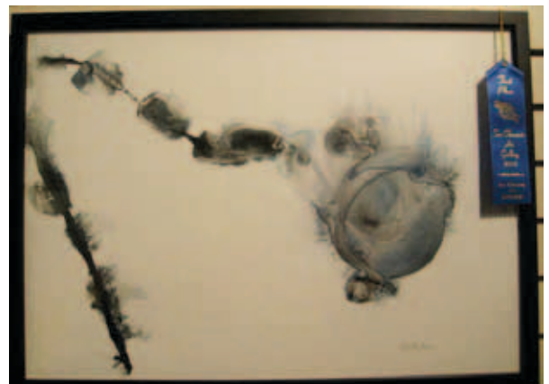
First Place: Winter Judged Show: Connie Beatty-Bean "Untitled"