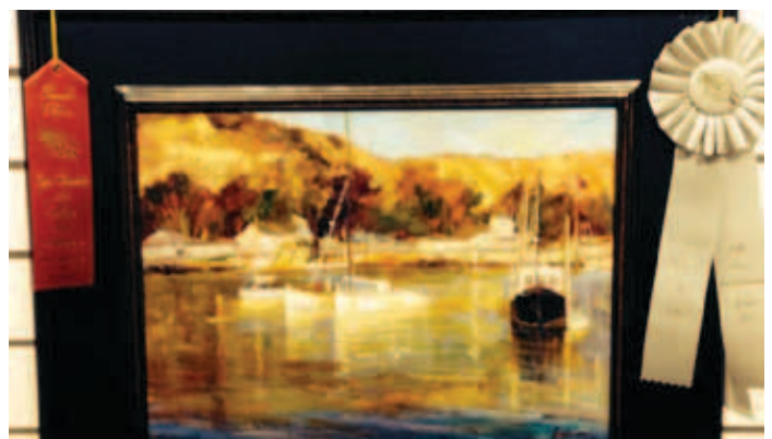
First Place: Janine Salzman "Dana Point Summer"