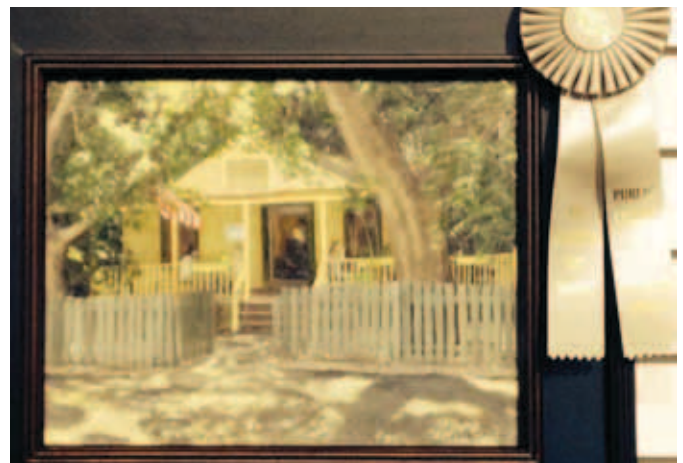
First Place: Sue Eberhardt "Hidden House Cafe"