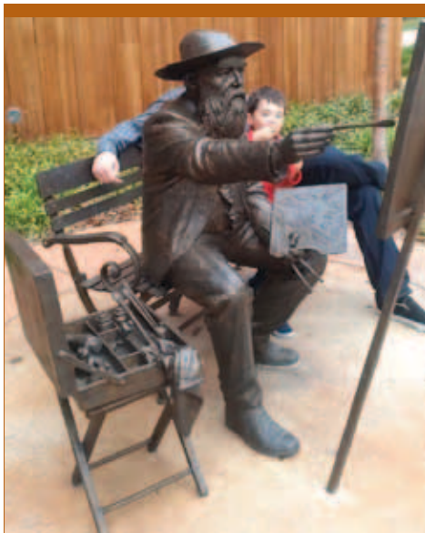
True Plein air Painter