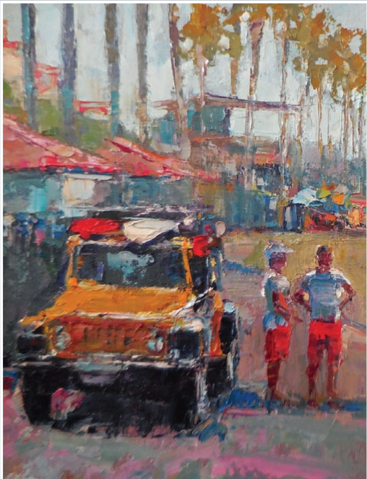
PAIGE ODEN "LIFE GUARD CHAT"