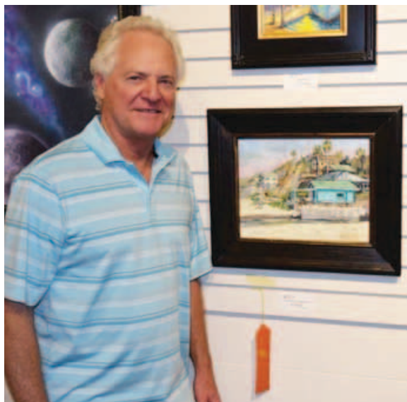
HM Oil Landscape- Jim Alexander